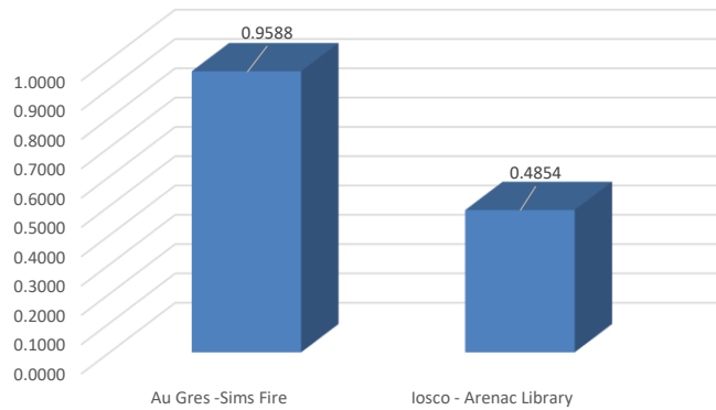
Taxing Authority Total Millage Rate Comparison